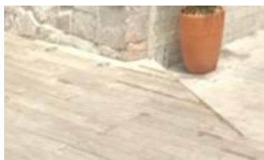
d) Outdoor wood floors