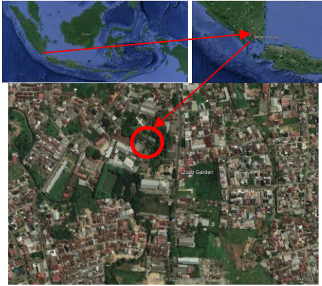
Figure 1. Zozo Garden Cafe Location Map