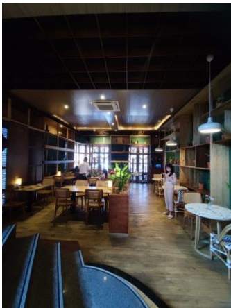
Figure 2. Zozo Garden Indoor Interior

Square geometric shapes dominate the interior with a wide enough scale of furniture, such as tables, chairs, windows, and large doors. Lines that are long and wide visually make a space feel expansive to form the visual character of a line depending on everyone's perception.