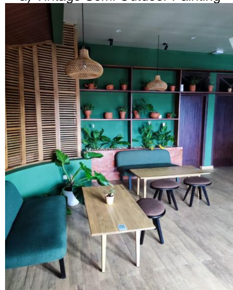
b) Floor Furniture and Ornaments 2