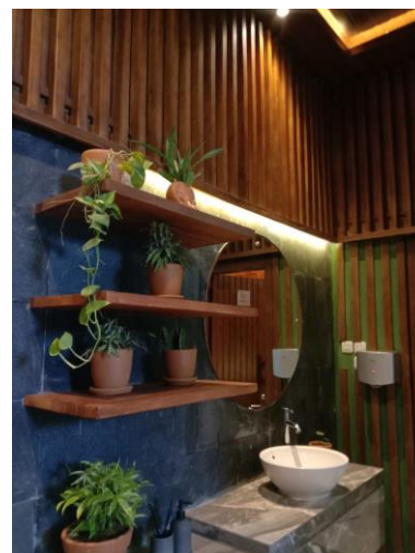
Figure 9. Wall Ornaments

Dominated by a deep black hue, the toilet exudes a mysterious yet elegant feel. The wall's texture, resembling weathered wood, further reinforces the vintage impression. The spotlight's beam falling on the wall's surface creates intriguing shadows, as if telling stories of the past. A vintage vibe is strongly felt in this toilet. The dull, dark brown walls, combined with engraved geometric patterns, create a classic and luxurious impression. The warm light from the LED strip encircling the mirror provides an intimate and calming feel.