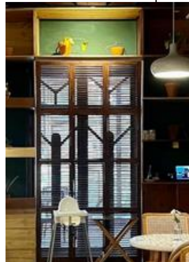
c) Indoor Wooden Windows