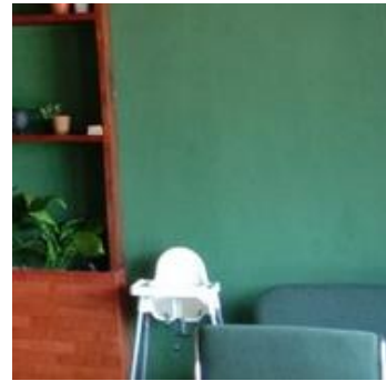
b) Indoor brick wall with color paint finish