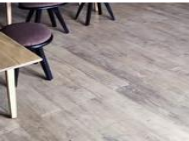
b) Indoor wooden floors