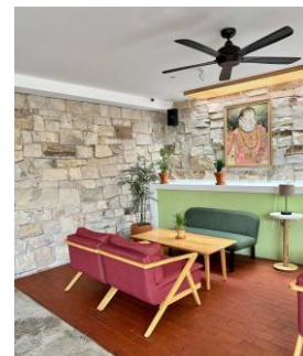
Figure 4. Semi Outdoor Area

The colors applied to the cafe are tropical colors, such as in the semi-outdoor area using warm colors on walls made of natural stone. Terracotta color on the floor combined with red and green furniture. Selection of the type of lamp is also essential for rooms with bright color accents.