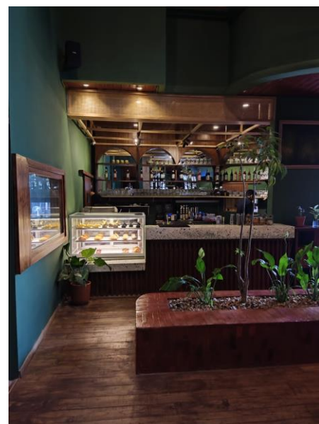
c) 1st floor furniture