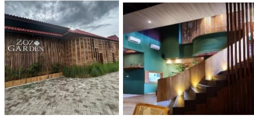
Figure 3. The shape of the Zozo Garden

Based on the figure, dynamic lines predominate in the form of the building facade to give an aesthetic impression of the facade of the building. Meanwhile, the curved lines in the wall area on the 2nd floor and indoor stairs use lighting from lamps that give a different and unique impression. The dynamic forms in the Secondary facade of the cafe and the Indoor area form patterns that can express unique movements.