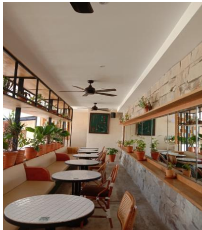
d) Semi-outdoor ornaments