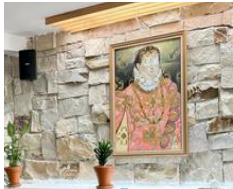
a) Vintage Semi Outdoor Painting

from round to square shapes, makes the room come alive, and visitors have many spots to suit their tastes.