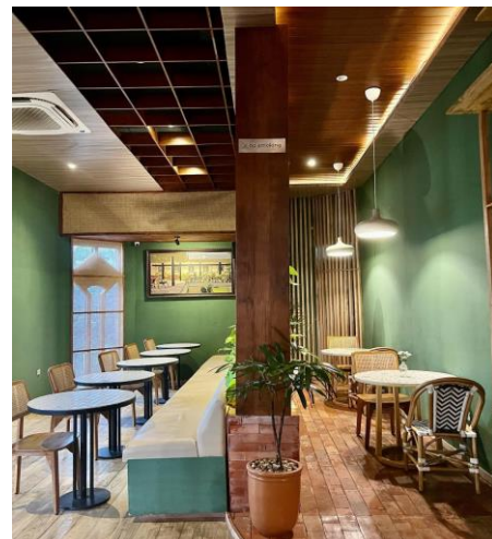
Figure 5. Indoor Areas

The colors of the cafe shows the warm nuance. The light uses white or light yellow the color. The wall color will stand out and become the room's primary focus. Apart from using warm colors, the indoor area of this café applies a vintage green color to the walls. The choice of these tropical colors can make the room's mood more relaxed, relaxed and reassuring. Visitors who want to relax or need a high focus on doing tasks can choose this room to get relaxed vibes.