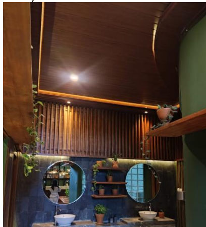
e) the use of round mirrors in the toilet area