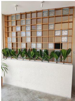
Figure 6. Semi-outdoor roasters

The selection of the vintage green color on the main wall is also combined with the selection of wooden furniture on the tables and chairs with artificial plant decorations, which give a more neutral impression. This color combination balances the color play in the room because the vintage green color will make the room heavier and gloomy when used monotonously. Using a roaster wall in a semi-outdoor area on one wall also makes a point of interest in a room. Visitors are invited to focus on one direction, which is also combined with the form of furniture and wall ornaments that support the function of the wall as a background to take Instagram-able spots.