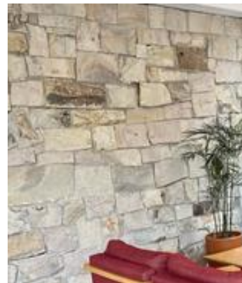
a) Semi Outdoor Natural Stone Wall

The selection of the type of material and its processing of the wall elements is considered very good. In its implementation, Zozo Garden Café uses natural stone wall material in the semi-outdoor area to create an aesthetic impression. It uses brick with a vintage green paint finish on the indoor walls, an aesthetic element in the form of a roaster dividing walls with artificial plants. The wood material is also applied in the door and window, making the room's nuance unique. The use of walls made of wood with