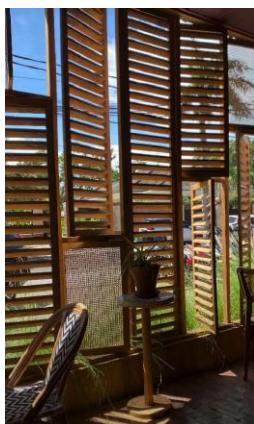
Figure 7. Secondary Skin

Applying patterns on the secondary skin cafe creates dynamics on the building facade. The pattern on this secondary skin café uses wood material. The use of wood materials can give an aesthetic impression to a building. Using secondary skin in a building also influences lighting, good ventilation, and visitor visuals. This secondary skin blocks incoming light, so visitors do not feel hot and dazzled by the sun. Secondary skin has a function to minimize the sunshine, so the room temperature is not hot and remains calm. The placement of this Secondary Skin also gives an impression that can attract visitors' attention to Zozo Garden Cafe.