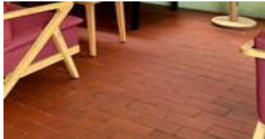
a) Semi Outdoor Ceramic Terracotta Floor

a blend of lines that seem harmonious as an indoor area is suitable for use. The use of wood with a glossy finish makes the wood grain and natural wood still visible, which Gives a harmonious and warm feel.