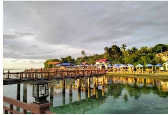
Figure 1: Batu Sori Tourist Destination, Baubau City, Southeast Sulawesi Province

Southeast Sulawesi Province, particularly Baubau City and South Buton Regency, are two of several tourist destinations with strategic, prospective, and unique potential, as well as competitiveness in the tourism sector, which require special attention and deeper and more specific study. One way to assess this tourism potential is through sustainable tourism product development, namely the process of creating and developing tourism products that are not only economically profitable but also environmentally and socially friendly (UNWTO, 2020).