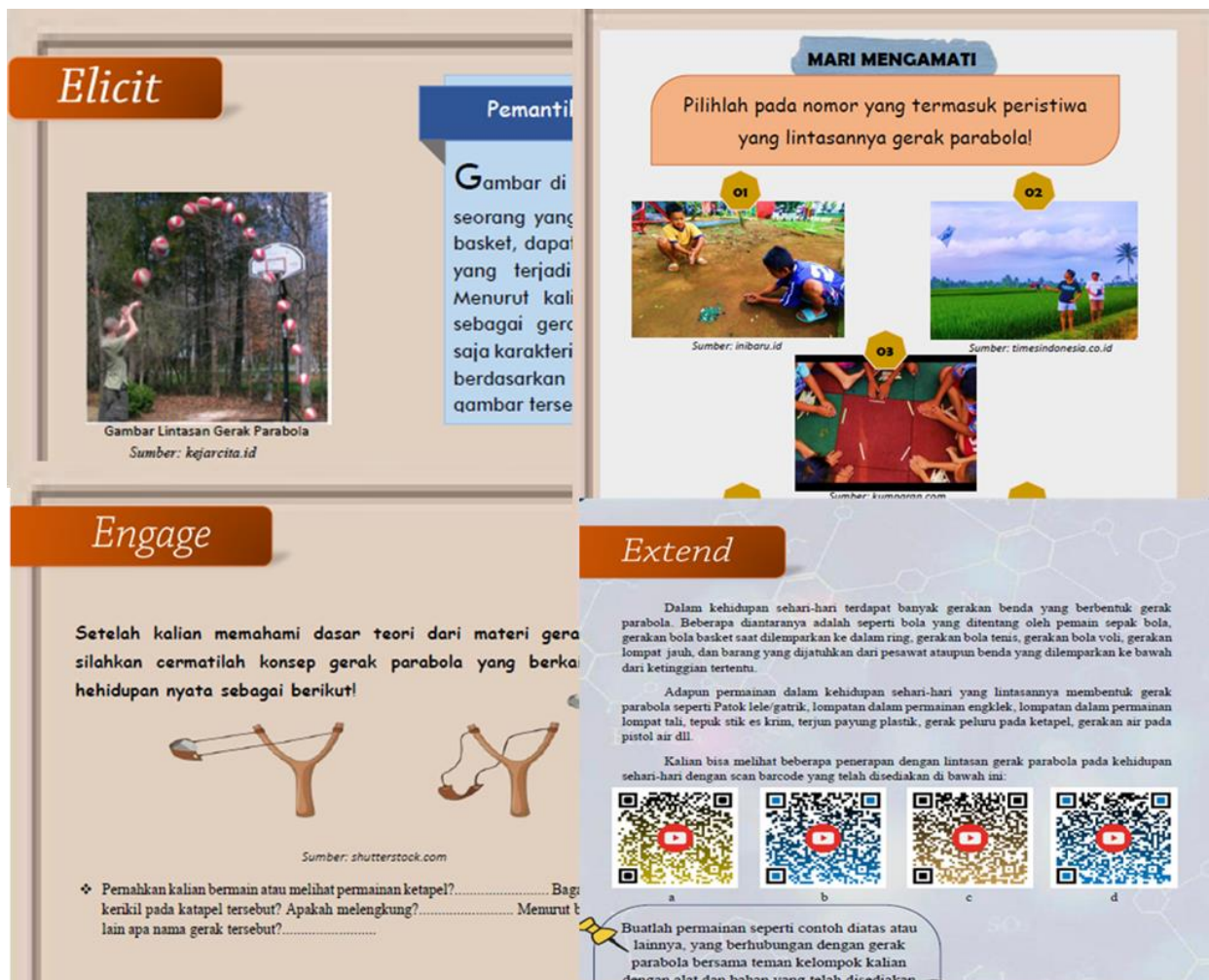
Figure 3. Contextual learning with 7E Learning cycle on the topic of parabolic motion

Thinking skills are honed through the Explain and Evaluate phases, where students describe scientific concepts and analyze data. Independence is developed in the Elicit and Evaluate phases through objective assessments of personal understanding. Collaboration is strengthened in the Explore and Elaborate phases through collaboration in simple experiments and group discussions.