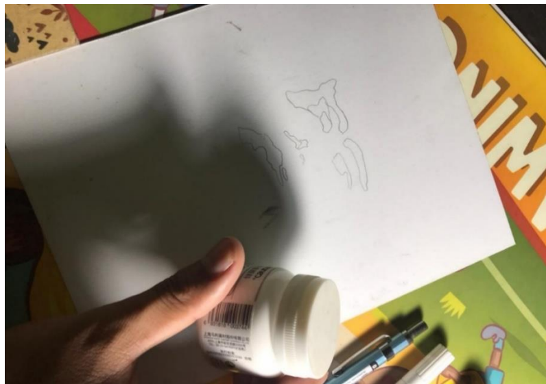
Figure1. The preparation of visual concepts through preliminary sketches as a composition guide

The result of this study demonstrate the practical application of revitalizing coffee husk waste into valuable art products within the creative economy sector. To provide a comprehensive understanding of this sustainable innovation, the empirical findings are presented alongside a detailed examination of the artistic production stages. The following section outlines the structured creative process involved in transforming raw organic waste into aesthetic and economically viable artworks.