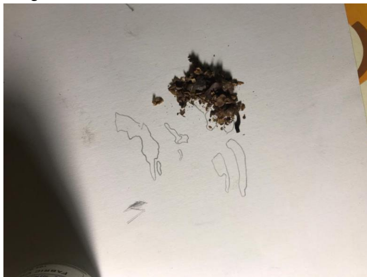
Figure 3. Application and pressing of crushed coffee husks onto the adhesive-coated sketch areas.

The next stage involves the preparation of coffee husk waste as the primary artistic medium. The coffee husks are first cleaned and dried to remove moisture and impurities. Afterward, they are crushed manually to achieve varied textures and particle sizes. This variation in texture is intentionally maintained to enhance the visual depth and organic character of the artwork. The use of untreated natural waste emphasizes the authenticity of the material and highlights its original ecological context.