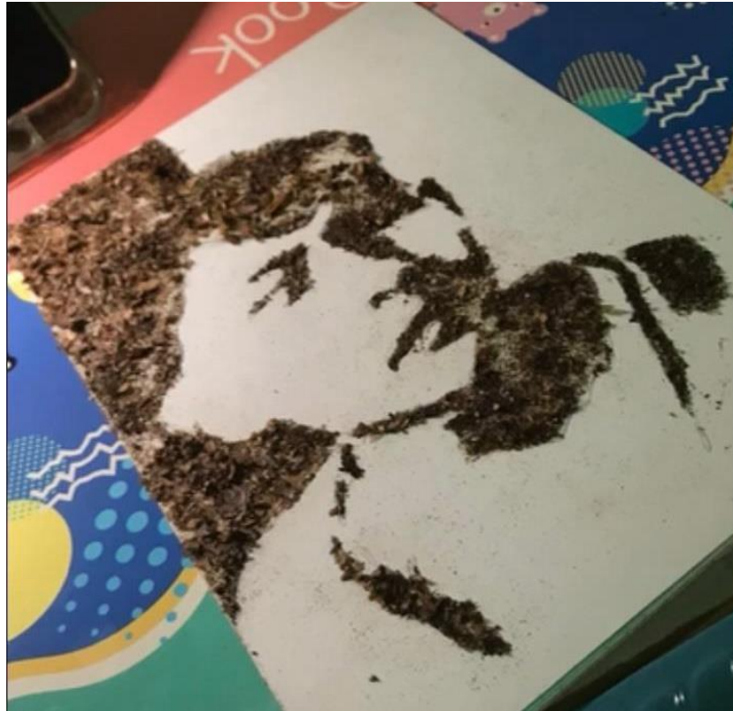
Figure 4. The final artwork of a human portrait made from coffee husk waste.

The final stage focuses on drying, refinement, and evaluation. After the adhesive has fully set, excess or loose material is removed, and minor adjustments are made to strengthen the composition. This stage allows the artist to assess the harmony between form, texture, and material. Through this method, coffee husk waste is transformed from an agricultural by-product into a meaningful visual artwork, embodying both aesthetic value and environmental awareness.